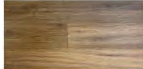
OAK NATUREL 8MM | AC 4 | 4V