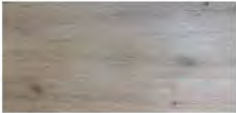
OAK LIGHT GREY MIX 8MM | AC 4 | 4V