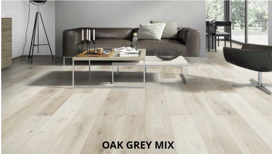
OAK GREY MIX