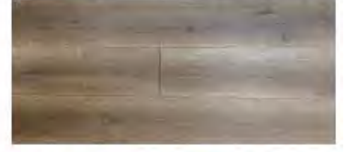
OAK LIGHT GREY BROWN 8MM | AC 4 | 4V