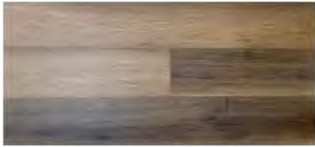
OAK BROWN MIX 8MM | AC 4 | 4V