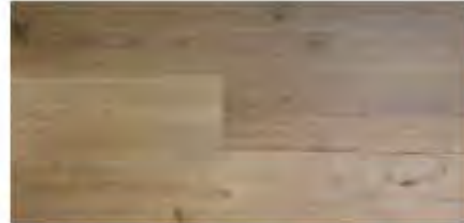
OAK NATUREL MIX 8MM | AC 4 | 4V