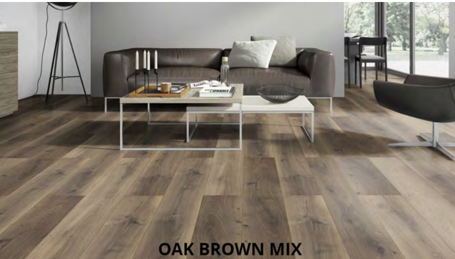
OAK BROWN MIX

With our new waterproof laminate the design and durability of your floor can finally go hand in hand together. The original character of the joints is in perfect balance with the design of the floor. The European quality design and colour variation extends throughout the floor and creates the feeling of real wood, for a fraction of the price. The 15 year manufacturers warranty offers you that peace of mind for years of hassle free cleaning and no moisture problems.