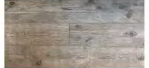
PINE CREME 8MM | AC 4 | 4V