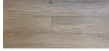
OAK LIGHT BROWN 8MM | AC 4 | 4V