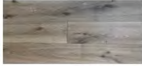
OAK GREY MIX 8MM | AC 4 | 4V